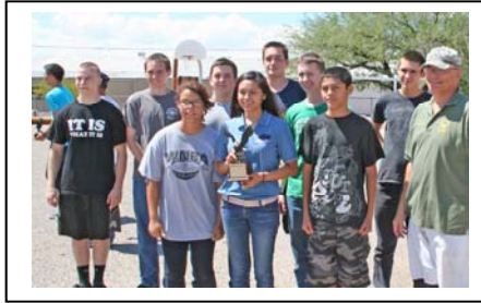
(The Flowing Wells ROTC Rifle Team)