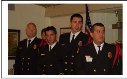
( Fire Safety Officers being Honored )