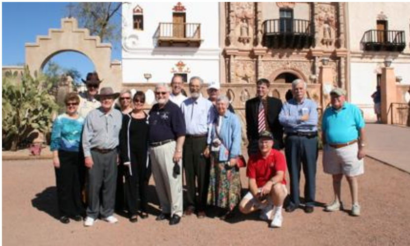
San Xavier Mission Photo