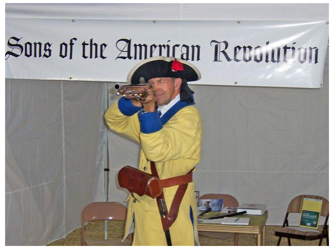
(Rudy can be a pretty convincing recruiter, don't you think?)