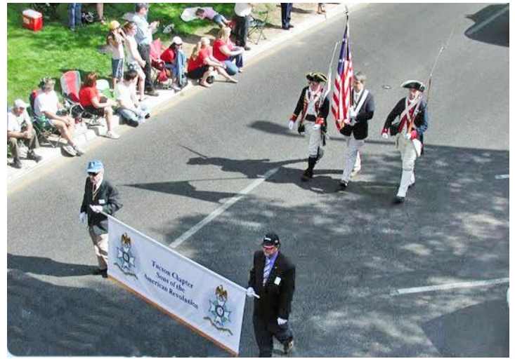
(Tucson Chapter Color Guard marching in Parade)