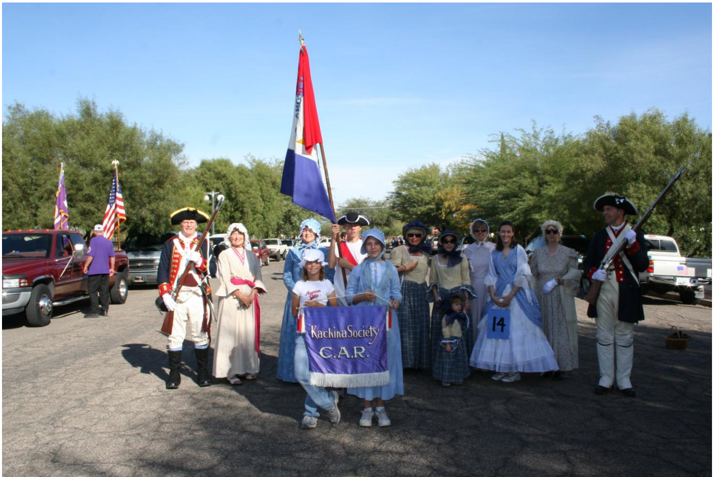
Members of the Kachina Society C.A.R., together with local D.A.R. and S.A.R. members