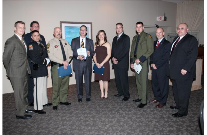
(The 2012 Law Enforcement Commendation Recipients)