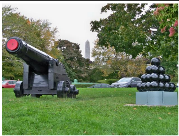
(For Veteran's Day - The Bunker Hill Monument in Boston, MA)