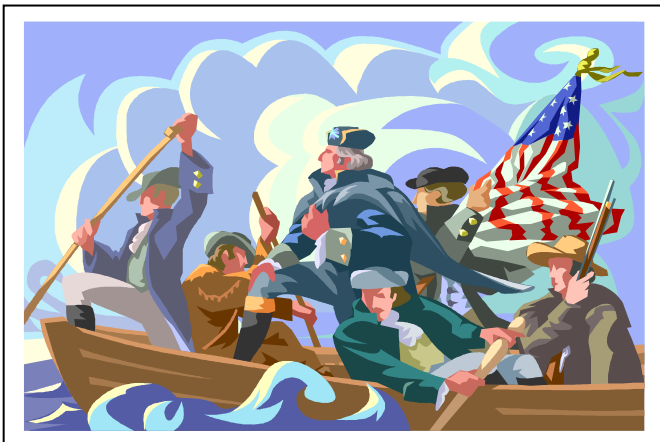
( Crossing of the Delaware River, December 25-26, 1776.)

Our Patriot ancestors were also looking toward the future. They put everything on the line to do their part to birth this great nation. Many lost crops, homes, businesses, or even their limb or life to fight for our freedom. This December, as we are off doing a thousand tasks for work, getting ready for the holiday gatherings, Hanukkah, Christmas, or New Years Day, please take time to remember your family patriot and the sacrifice he did during those cold winter nights so long ago, away from his family. Then think about our current servicemen and women away from home this season. Most of us have it easy in comparison. Please remember them in your prayers.