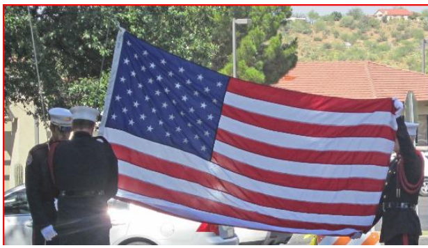
(The Raising of the Flag at the Saddlebrook Flag Day Ceremony, June 14th)