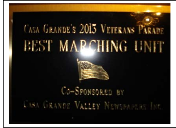
(The AZSSAR Color Guard won the Best Marching Unit at the Casa Grande Veterans Parade)