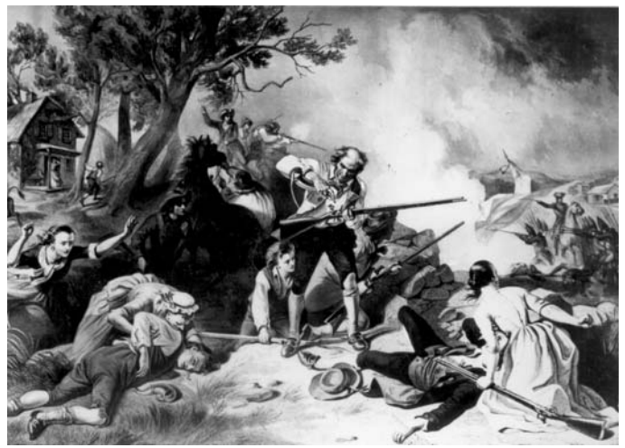
The first blow for liberty.

"A general dissolution of principles and manners will more surely overthrow the liberties of America than the whole force of the common enemy. While the people are virtuous they cannot be subdued; but when once they lose their virtue then will be ready to surrender their liberties to the first external or internal invader." -- Samuel Adams, 1779 Samuel Adams letter to James Warren, February 12, 1779