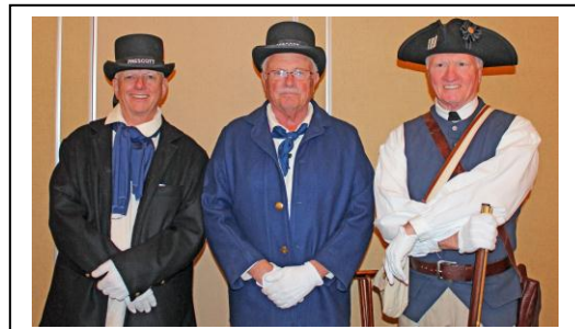
Board Mtg Casa Grande February 22, 2014