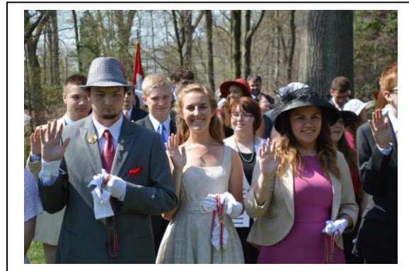
(The CAR installation on the Mt. Vernon grounds in Virginia)