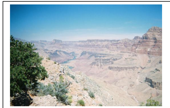
(Inner Grand Canyon, near Desert View Overlook)