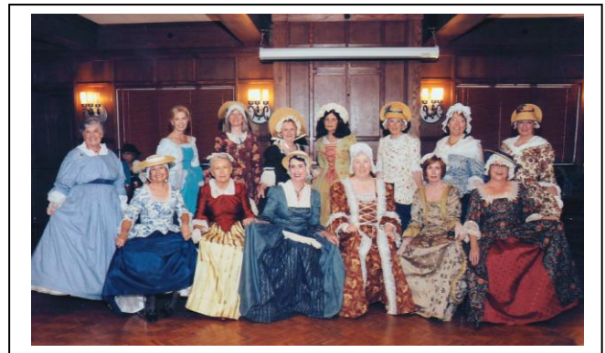
(Several of the ladies' wearing their finest before a tea at Christ Church Episcopal in Greenville, South Carolina while at Congress.)

ladies in their finest dresses while in Greenville, at Congress.