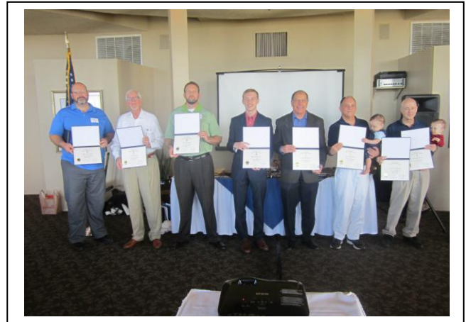
(Our new Tucson Chapter Members – see article for names)