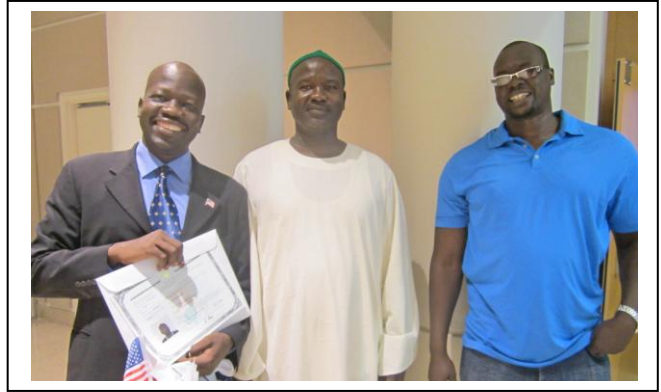
(New Citizens sans the Color Guard)

Submitted by: Al Niemeyer, Tucson Chapter Color Guard