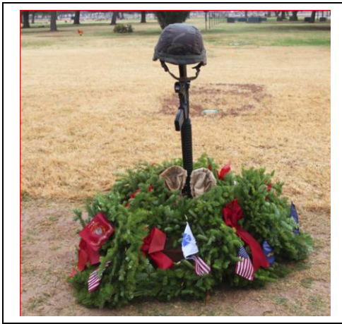
(Helmet & Boots with Wreath)

During heavy skies that alternated between a drizzle and a moderate rain, the Tucson Chapter Color Guard presented the Colors and later fired a flintlock salute to the honored dead at the Wreaths across America Ceremony in Evergreen Cemetery. Several speakers were featured in the Saturday Morning Ceremony as the guard stood at ease in the rain. The Guard retired the colors as the ceremony was dismissed with visitors fanning out and placing ceremonial wreaths on veteran's graves though out the cemetery. Everyone attending felt it was a very satisfying, albeit very wet, morning. Article by Al Niemeyer.