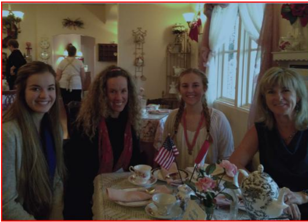
(CAK members at Chantilly Tea House)