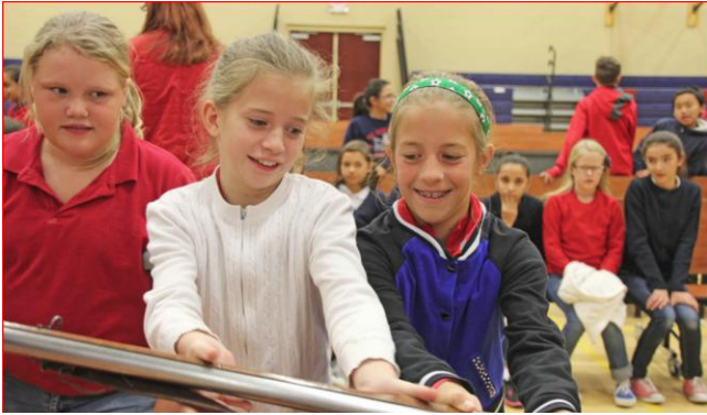
(It takes two girls to lift a musket)