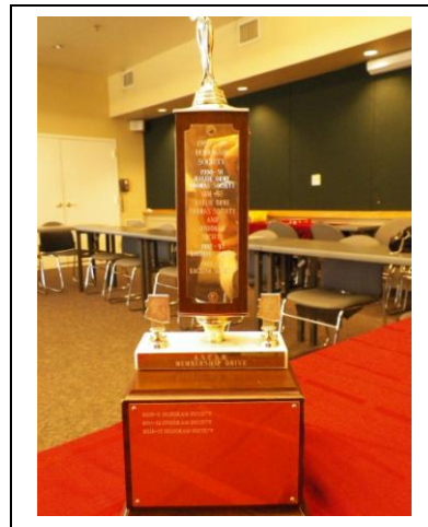
(The ASCAR Membership Drive Trophy)

The CAR State Membership Committee awarded Kachina Society the Membership Drive Trophy for NINE new members this past year, edging out the Hallie Orme Thomas Society who had eight new members. We are informed that the prize money will be used toward a celebration party. Way to Go Kachina!