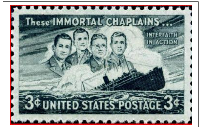
(3cent U.S. Postage Stamp - Interfaith in Action)