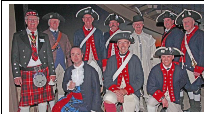
(The Color Guard at the 2015 Law Enforcement Dinner)

http://www.sahuaritasun.com/news/sahuarita-officer-honored-for-exemplary-work/article_7470da40-a8e4-11e4-a558-e3ecd7b86a26.html