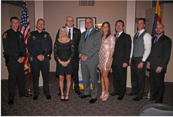
(The 2016 Law Enforcement Award recipients)