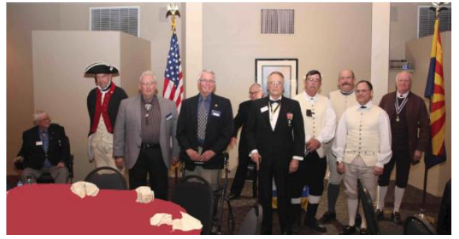
(Chapter officers for 2016/2017)